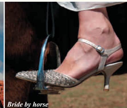
Bride by horse