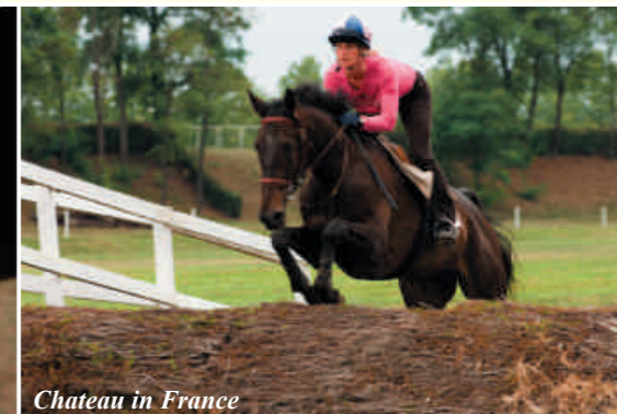
Chateau in France

The last few years we have a close co-operation with a partner in each country; France, England, Holland and USA. Between us we have a good 110 years of experience in our field of producing and selling riding holidays. Should you be a resident of any of these countries, you can book directly with them (we will be happy to pass you on to them). But as a resident of any Nordic country (or other country), you are welcome to find your holiday under the English version on our website. If you read and understand Swedish, you are welcome to view it in Swedish off course.