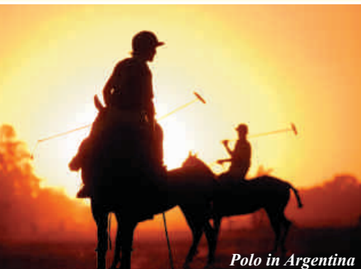
Polo in Argentina

You will find many options for all kind of riders, preferences in all price ranges. You can choose between most of the destinations in the world were horse riding can be offered with good standards and the animals are treated with love, care and respect. There is something for every kind of rider and every wish, for sure. Greenways Travel have a long, genuine experience of producing and selling riding holidays, the best that can be offered around the world. We have been doing this in Sweden since 1997. Now also to be booked from FINLAND, DENMARK & NORWAY.