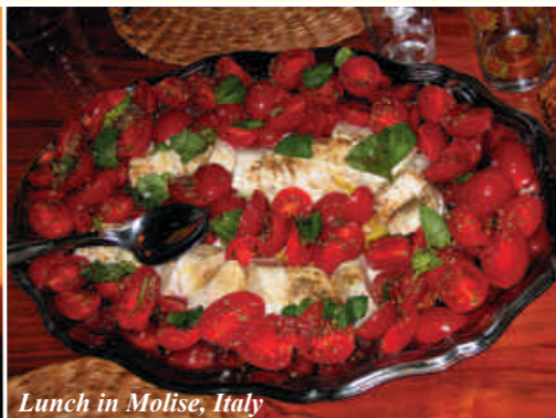
Lunch in Molise, Italy